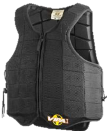
Standard: EN13158:2018 Level 1