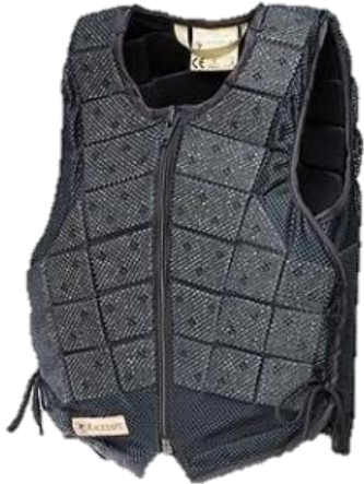
Standard: EN13158:2000 Level 1