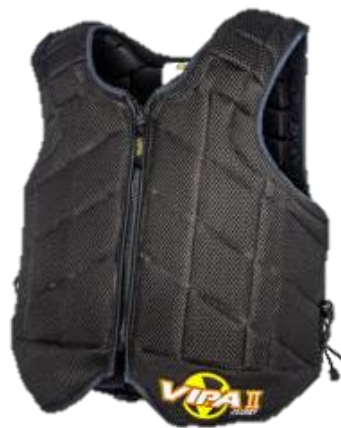
Standard: EN13158:2018 Level 2