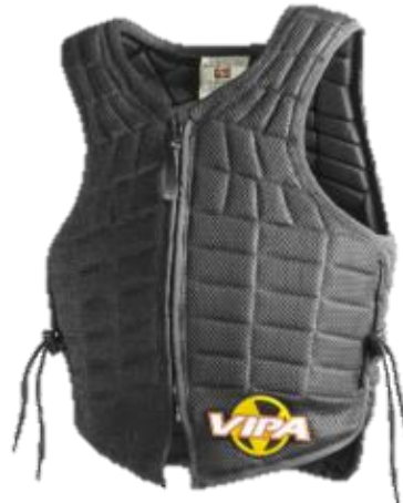
Standard: EN13158:2018 Level 1