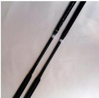
McKey Slick Stick