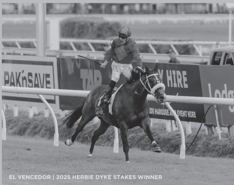
EL VENCEDOR | 2025 HERBIE DYKE STAKES WINNER

Wednesday 4th February 2026 at 10am: $8,050