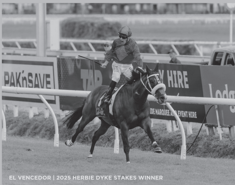
EL VENCEDOR | 2025 HERBIE DYKE STAKES WINNER

Wednesday 4th February 2026 at 10am: $8,050